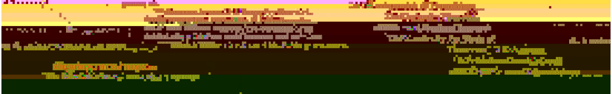
Figure 4: Localisation de la zone d'étude.